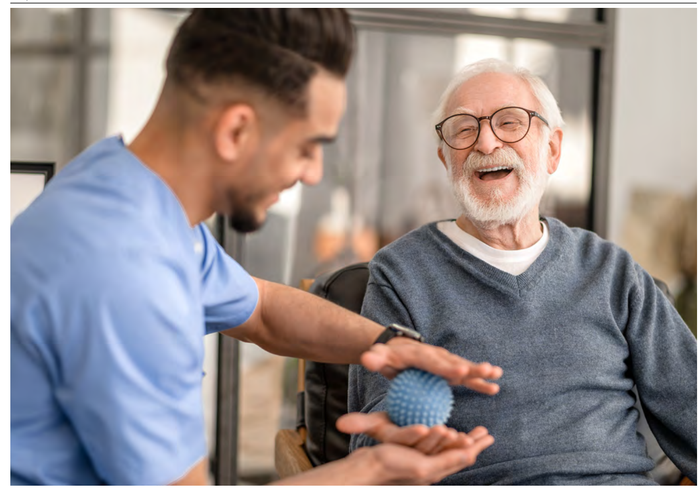
10 | RESEARCH, INNOVATION AND ENTERPRISE