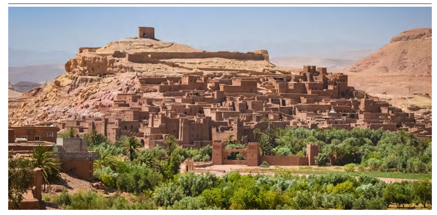
22 | RESEARCH, INNOVATION AND ENTERPRISE